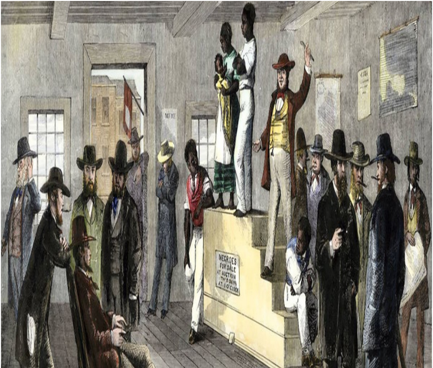
George A. (1861). Slave Auctions in Richmond, Virginia [Illustration]. Slavery Images: A Visual Record of the African Slave Trade and Slave Life in the Early African Diaspora, Virginia, United States .

https://www.historynet.com/online-exclusive-the-great-slave-auction.htm