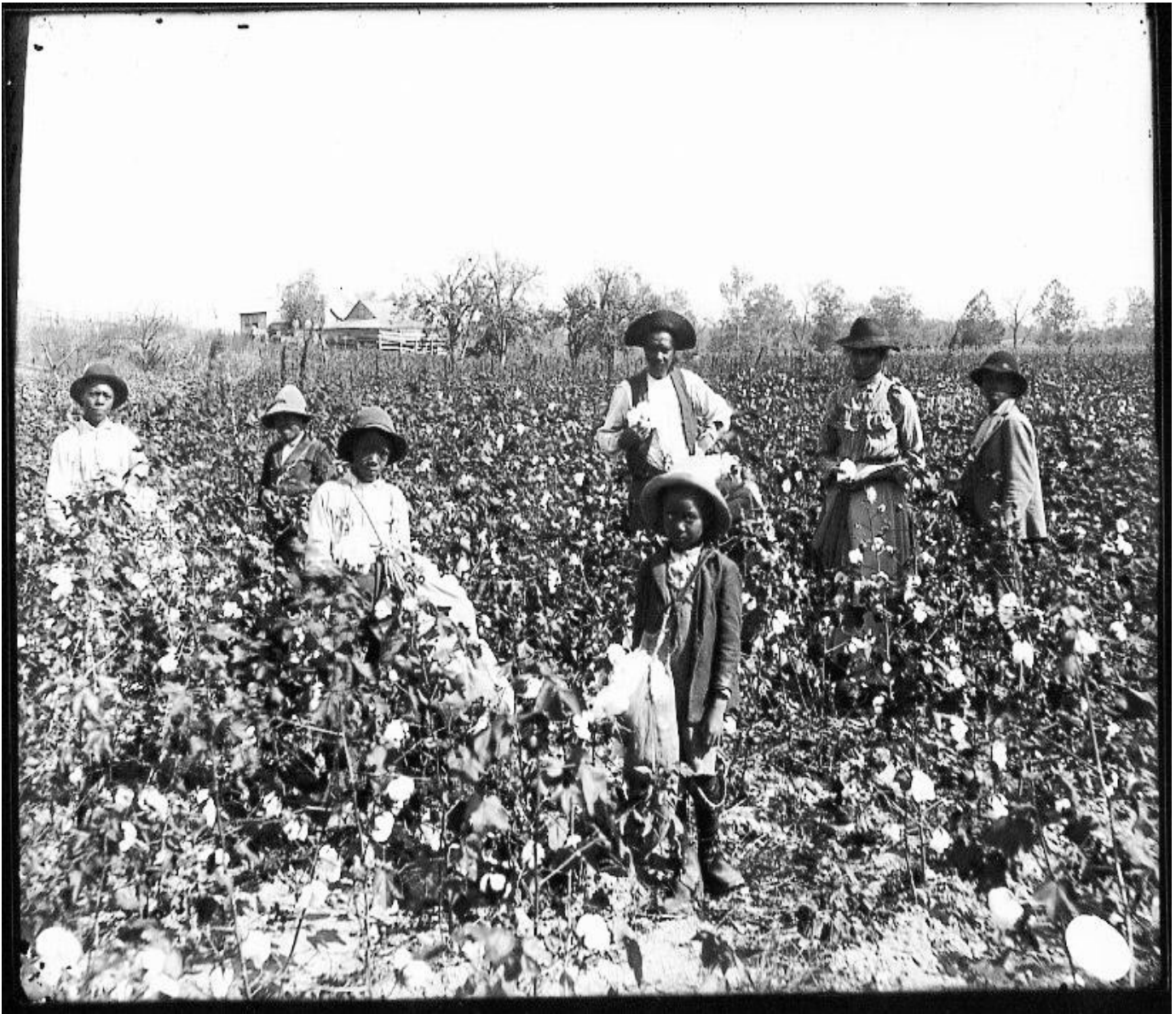
(c.1890s). Black cotton farmers in the US [Photograph]. United States.

https://en.wikipedia.org/wiki/African-American_history_of_agriculture_in_the_United_States#/media/File:Black_cotton_farming_family.jpg