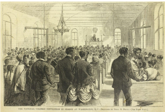
National Colored Convention Washington, DC 1869