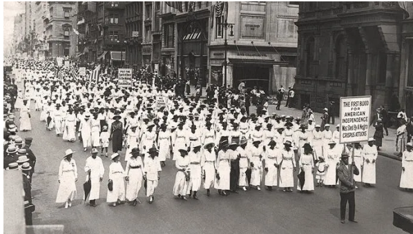
Silent Protest New York City, 1917 NAACP