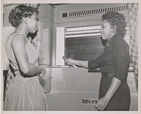
Citizenship Education Project National Council of Negro Women Voting Machine