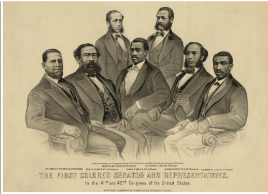
An 1872 portrait of African-Americans serving in Congress (from left): Hiram Revels, the first black man elected to the Senate; Benjamin S. Turner; Robert C. De Large; Josiah T. Walls; Jefferson H. Long; Joseph H. Rainey; and R. Brown Elliot.