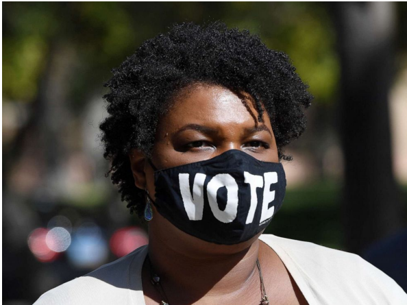
Stacey Abrams Voting rights The New Georgia Project