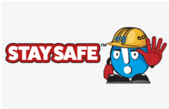
Stay safe at work