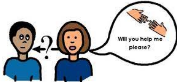
Ask for help at work