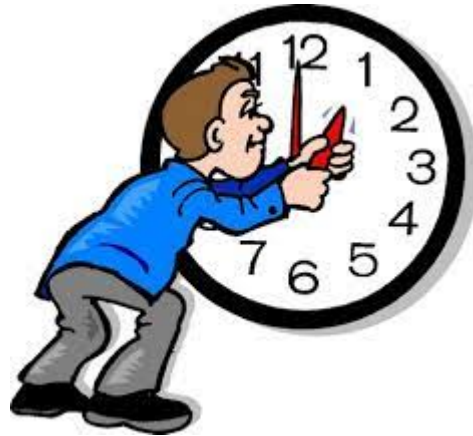
Manage my time at work