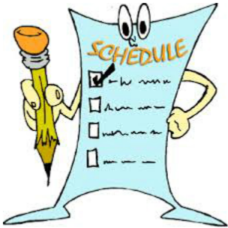
Follow a schedule