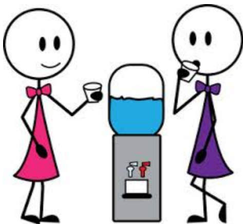
Get along with coworkers