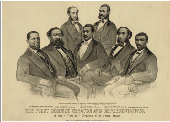
An 1872 portrait of African-Americans serving in Congress (from left): Hiram Revels, the first black man elected to the Senate; Benjamin S. Turner; Robert C. De Large; Josiah T. Walls; Jefferson H. Long; Joseph H. Rainey; and R. Brown Elliot.

https://www.loc.gov/pictures/item/98501907/