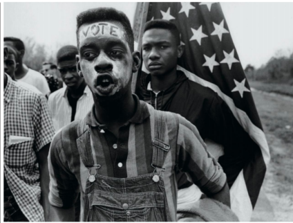
A demonstrator at the 1965 march from Selma to Montgomery, led by the Rev. Dr. Martin Luther King Jr. to fight for black suffrage.

https://www.history.com/news/the-silent-protest-that-kick-started-the-civil-rights-movement