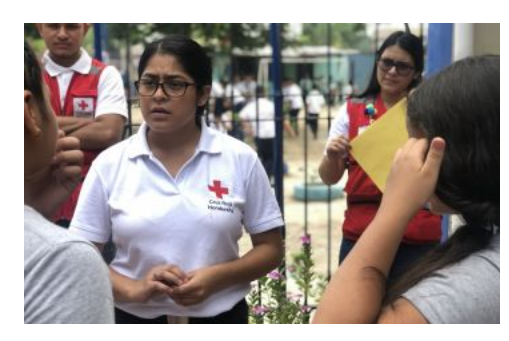
This Story is a part of:

But the U.S. has a new policy called the Migrant Protection Protocols, or MPP. It says Central Americans must stay in Mexico as their cases are decided in U.S. Immigration Court (see "Border Crisis"). In the past, they could wait in the U.S. MPP doesn't apply to Mexicans. They stay in Mexico too, but are put on a waiting list to ask for asylum.