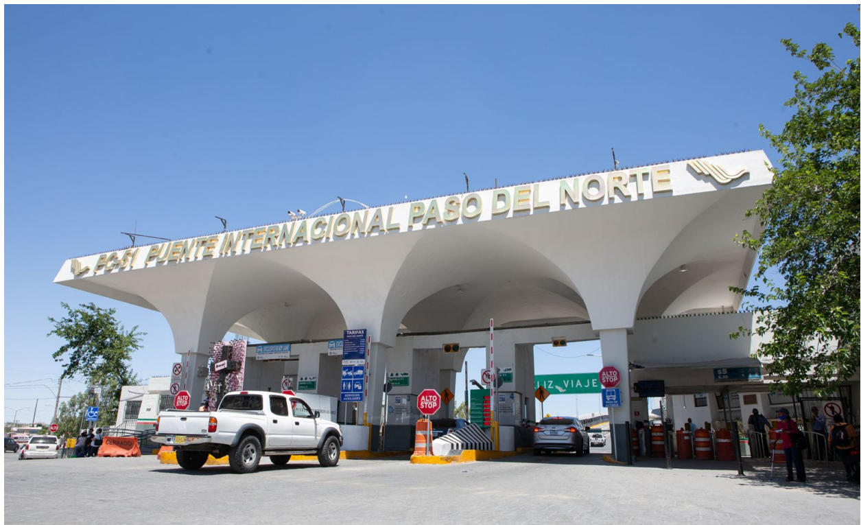
The Paso del Norte Bridge in Ciudad Juárez. Mexico, 2020.