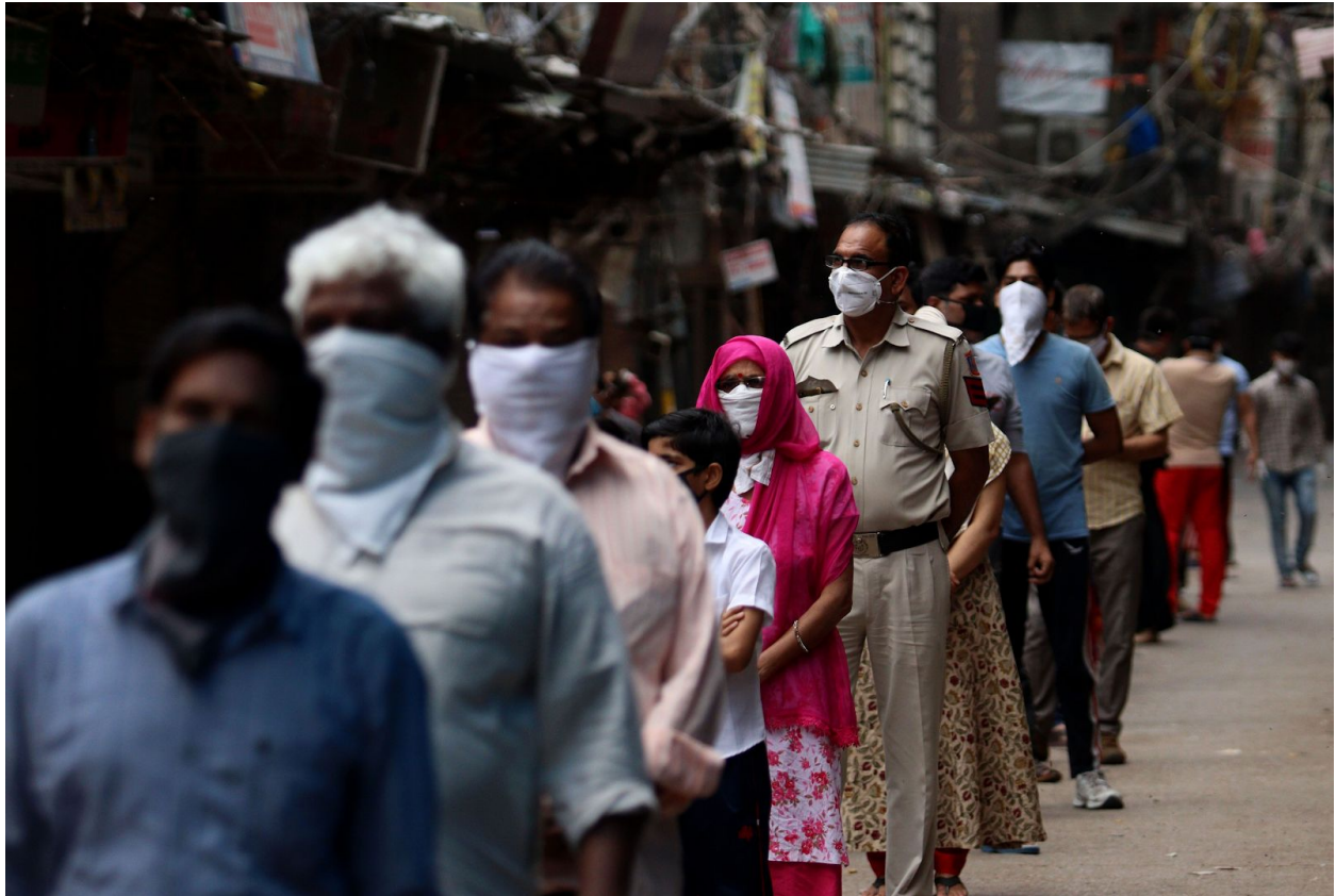
Mobile Covid-19 testing van in India. Delhi Police cop along with people stands in a queue for coronavirus test at Red Zone area, old Delhi. India, 2020.