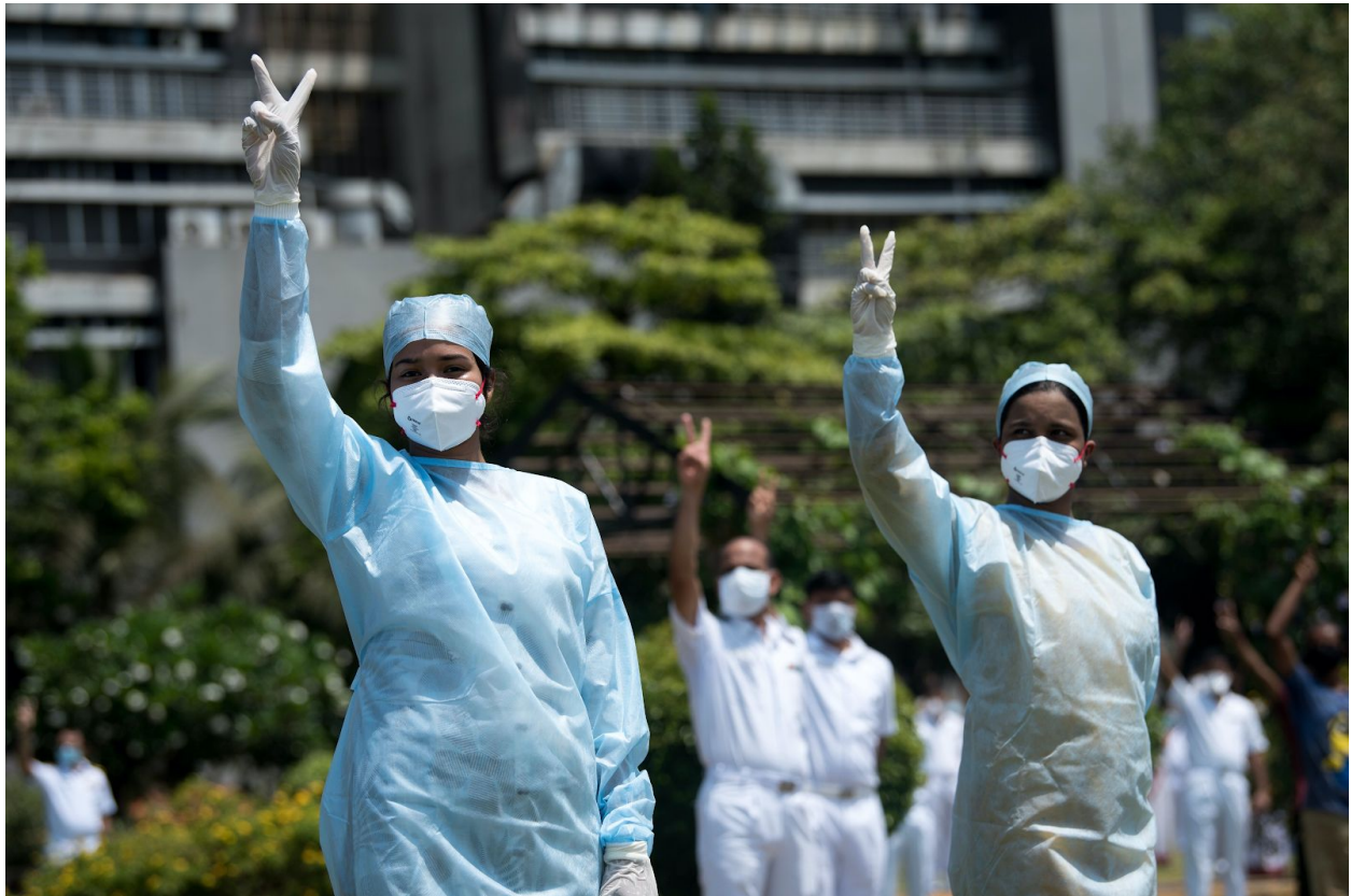
Hospital staff in Mumbai pay tribute to those involved in the fight against the spread of the coronavirus. India, 2020.