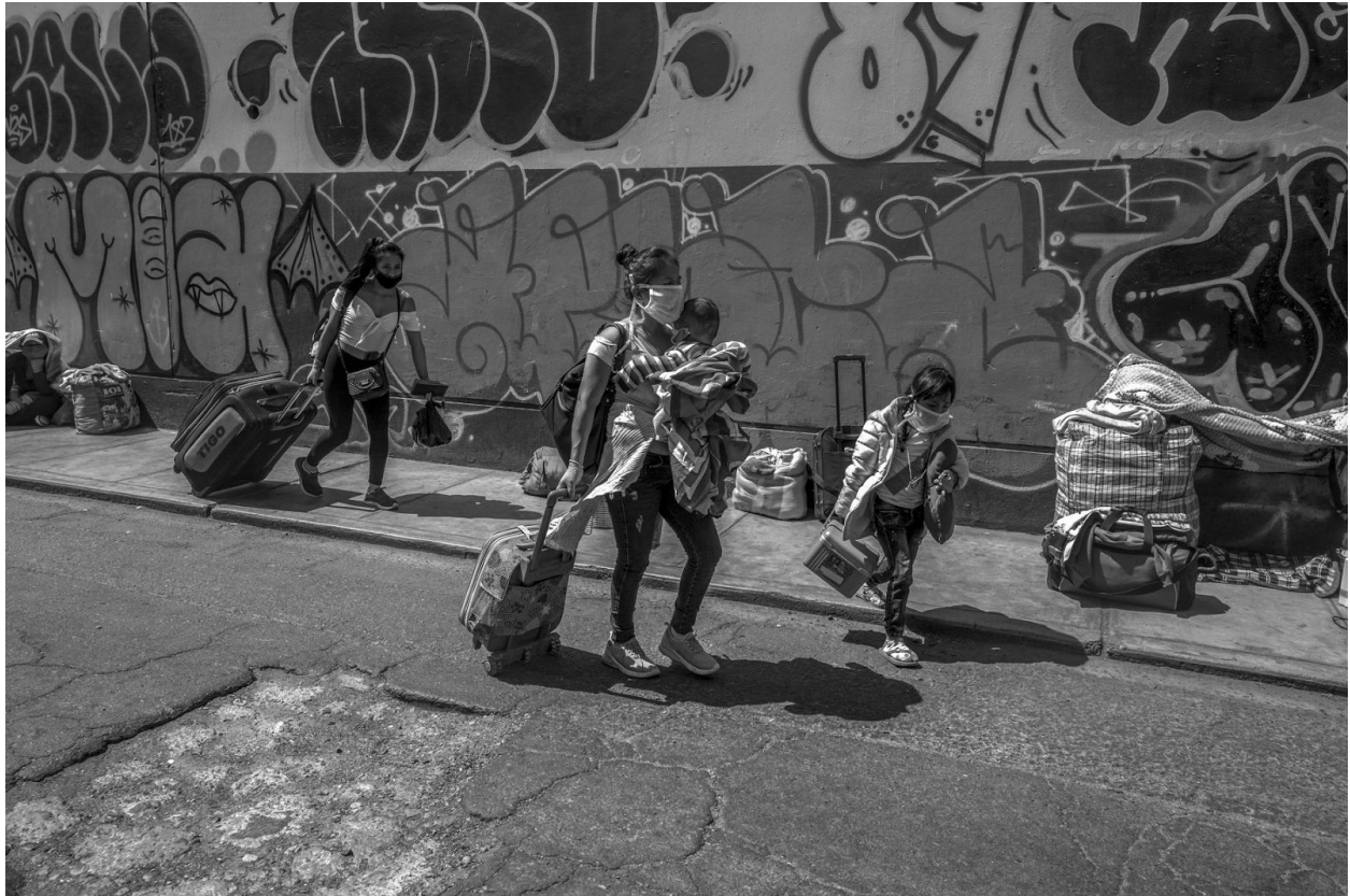
Uncertainty. Hundreds of people roam in search of places to leave Lima. Peru, 2020.