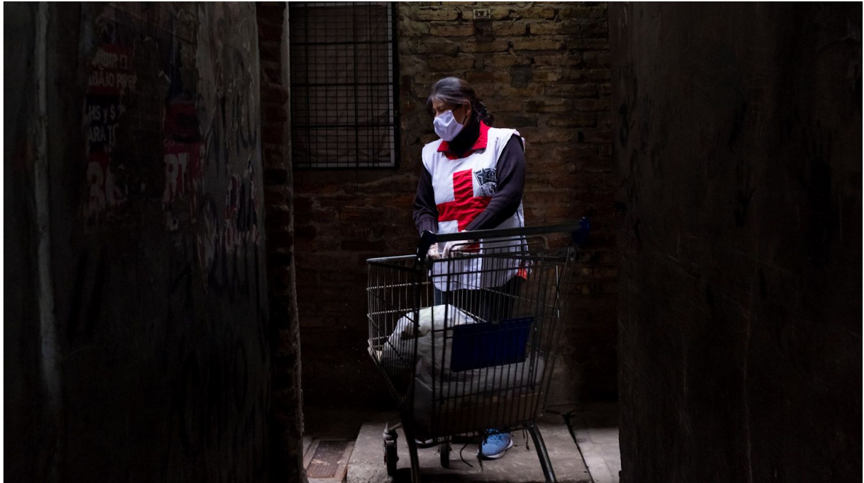
Argentina, 2020.