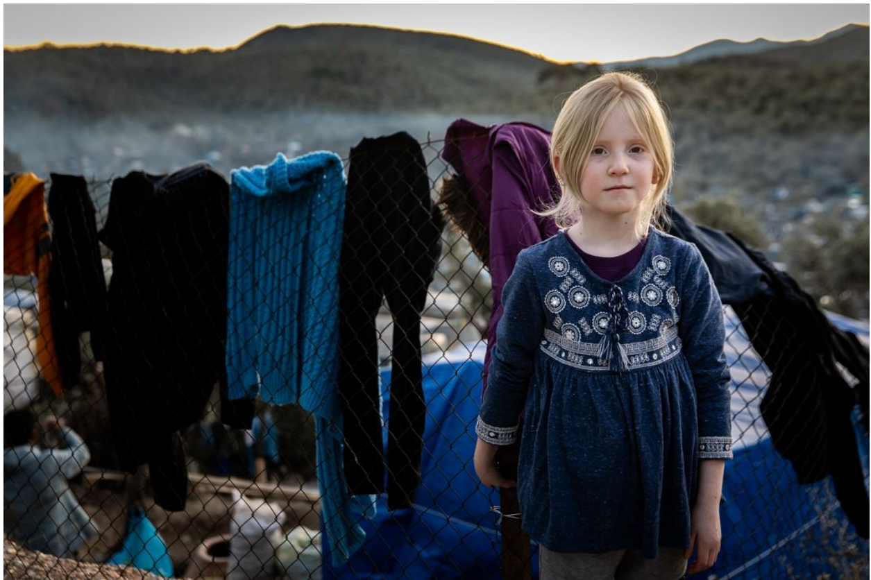
A young girl stands near the laundry she hung to dry in Moria on Lesbos on January 4, 2020. Approximately one-third of the over 20,000 people in Moria are children, and an estimated 1,500 of them are unaccompanied minors. Greece, 2020.