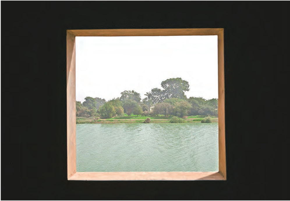
Mauritania is visible from the window of an abandoned building in Podor across the Senegal River. When Omar ibn Said was alive, Moors from Mauritania crossed the river to raid villages along the banks and capture people.

“I was 37 years old when I left my country. So I (have) lived in the land of Christians for 24 years.”