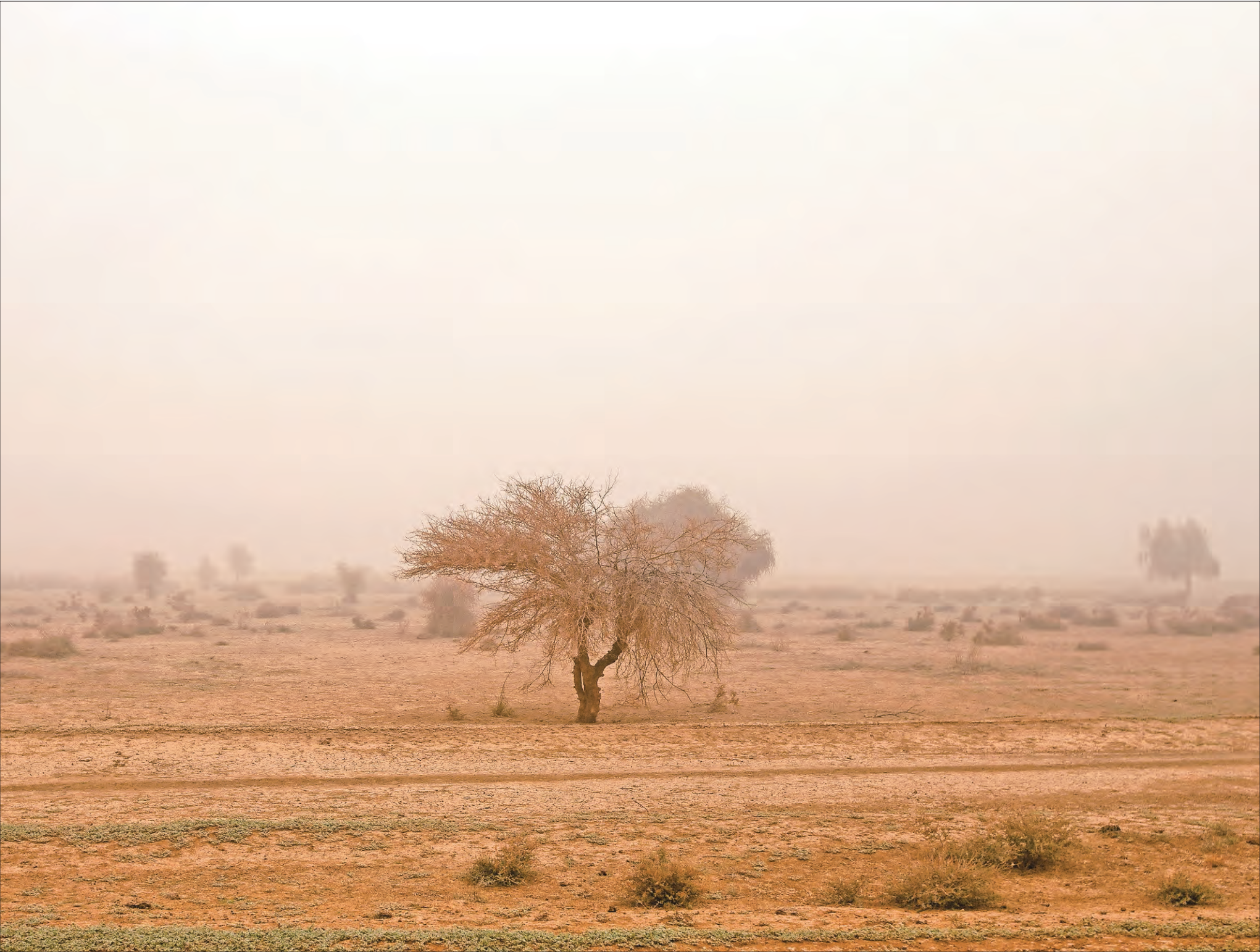
Shrouded in dust, the Isle of Morfil was a more fertile landscape hundreds of years ago before the dry weather turned the land into a desert.