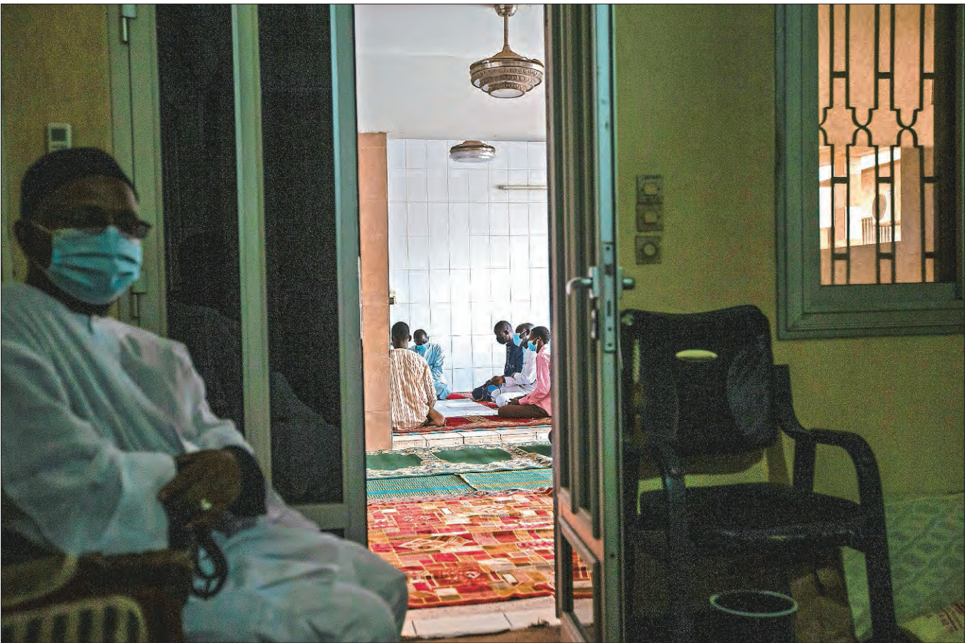
Men gather inside the home of the imam of the Mausolee Seydou Nourou Tall to chant verses from the Quran before Friday prayer service, in Dakar, Senegal.

As his life settled into a new rhythm, Omar clung to his Muslim faith. Praying five times a day and strictly observing Ramadan gave structure and holiness to his life. He preserved a modest Muslim appearance, covering his head and body. And he wrote prayers in Arabic, then tacked them to trees on the plantations, a common practice back home. Nobody around could read them. Whites figured he had written thanks to the Owens