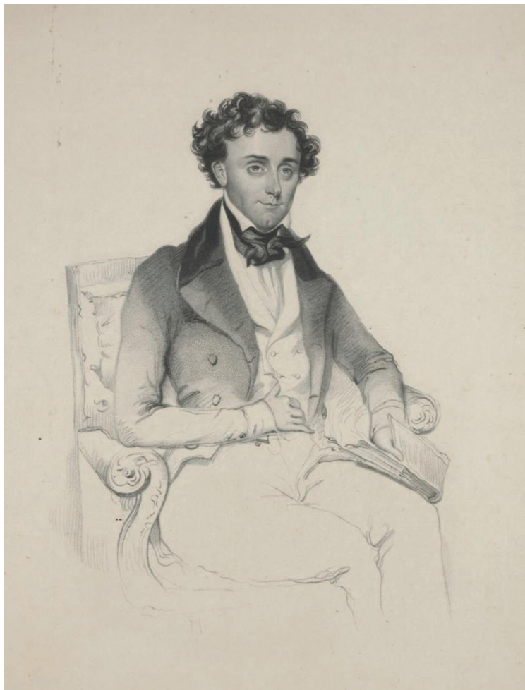
The blackface performer Thomas Dartmouth Rice (T. D. Rice), who pioneered the “Jim Crow” character, in a portrait from the mid-1800s.

The truth is more bounteous and more spiritual than that, more confused. That confusion is the DNA of the American sound.