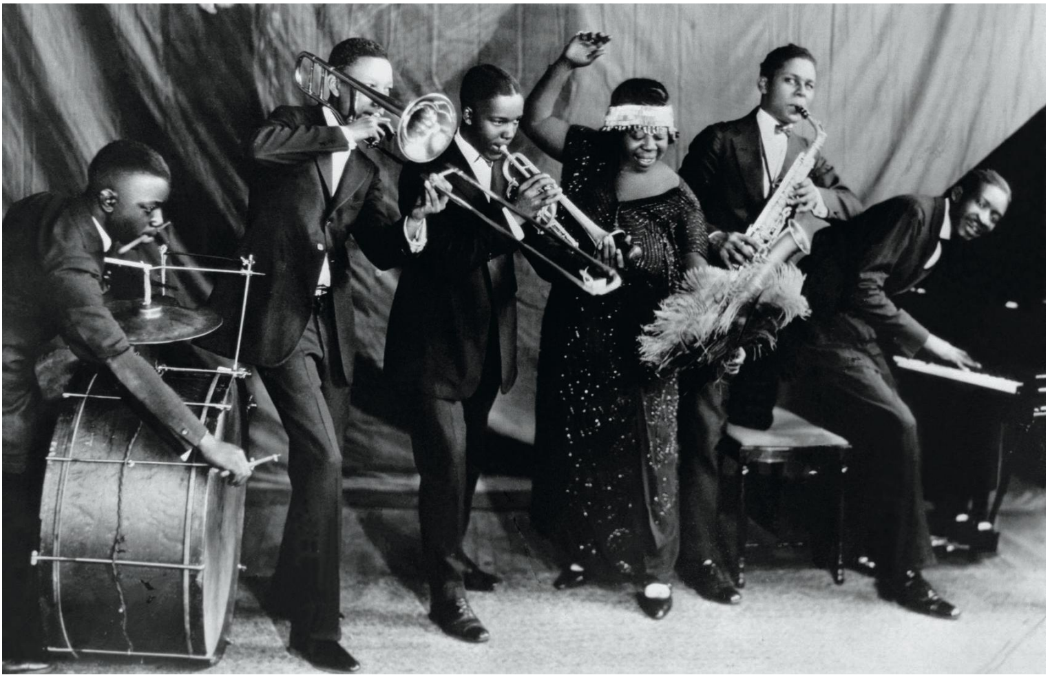
Ma Rainey, an early blues singer who performed in black minstrel shows, with her band.

before. What they saw caused a permanent sensation. He reportedly won 20 encores.