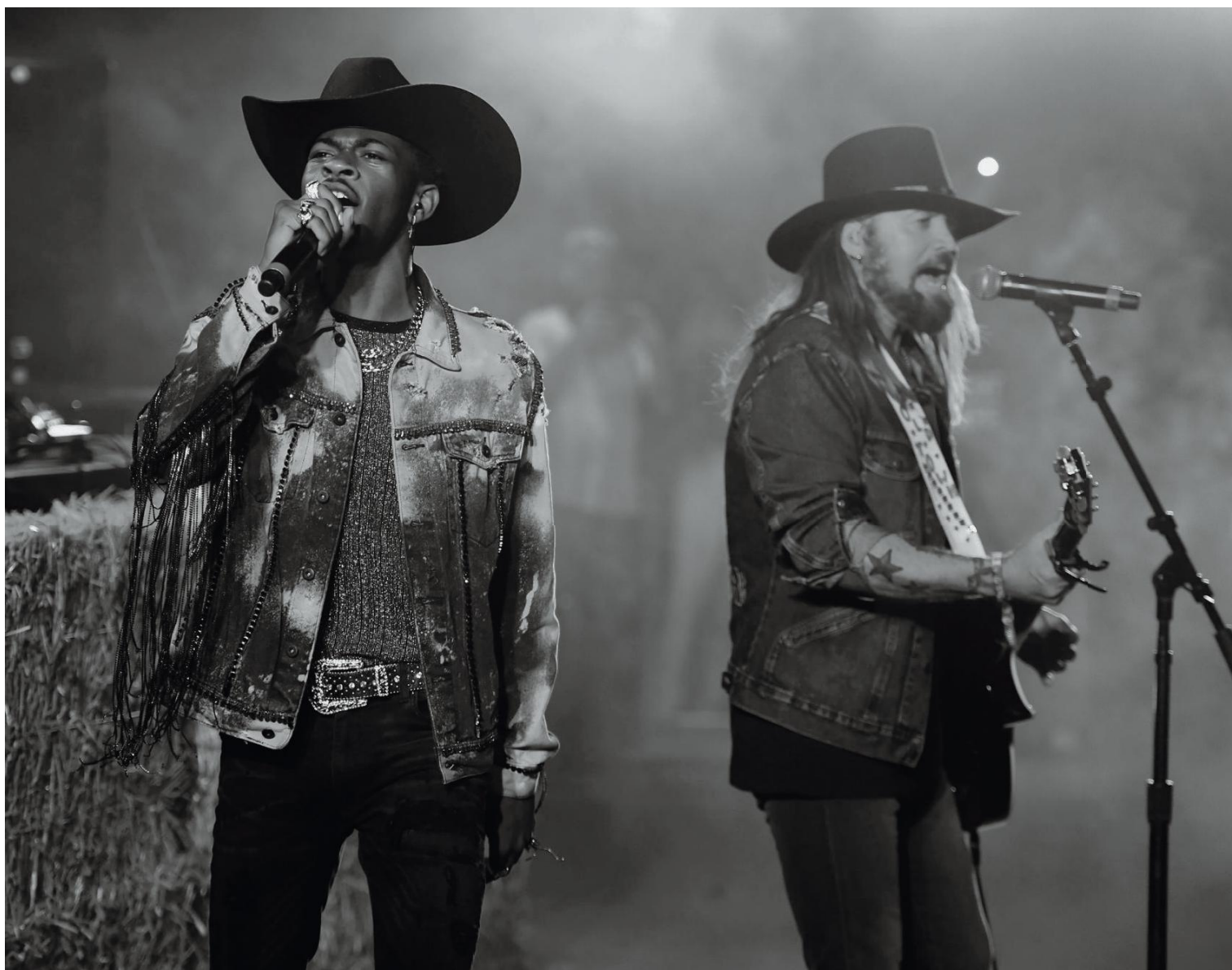
Lil Nas X, left, and Billy Ray Cyrus perform in Indio, Calif., in 2019.

fantasy. The song snowballed into a phenomenon. All kinds of people — cops, soldiers, dozens of dapper black promgoers — posted dances to it on YouTube and TikTok. Then a crazy thing happened. It charted — not just on Billboard’s Hot 100 singles chart, either. In April, it showed up on both its Hot R&B/Hip-Hop Songs chart and its Hot Country Songs chart. A first. And, for now at least, a last.