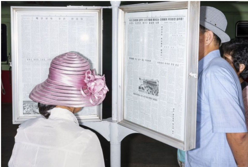
Commuters reading the official newspaper on a Pyongyang Metro platform. North Korea, 2017.