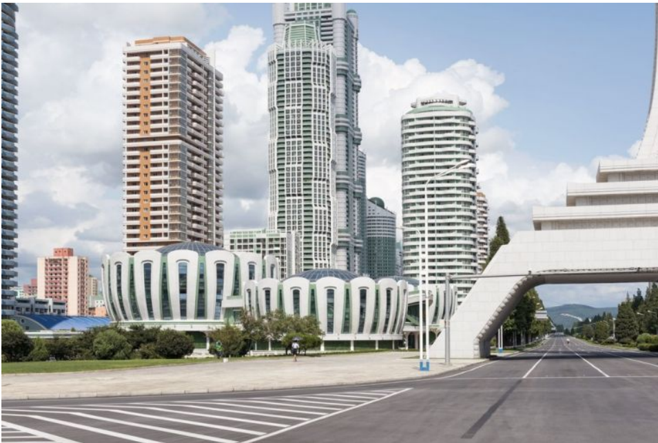
New apartment buildings on Ryomyong Street. North Korea, 2017.