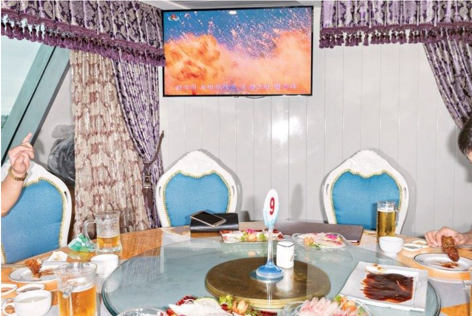
At lunchtime on a boat on the Taedong River, the state TV channel broadcasts images of artillery, missiles, and fighter jets. North Korea, 2017.