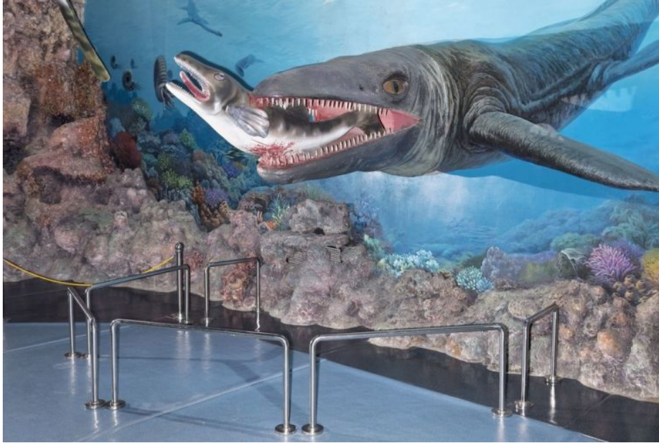
A mural at the Museum of Natural History. North Korea, 2017.