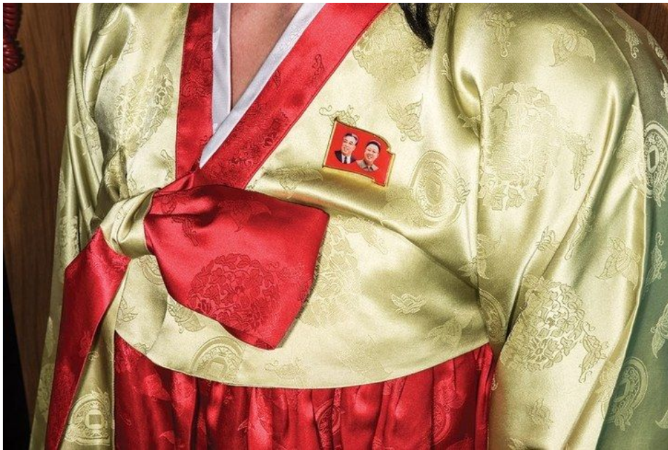
Citizens over the age of sixteen are expected to wear a badge celebrating at least one member of the Kim family. North Korea, 2017.