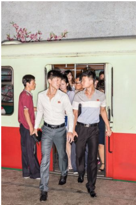
Commuters on the Pyongyang Metro. The capital, marooned by politics, presents a panorama from another time. North Korea, 2017.

For Pak and other analysts in North Korea, the more important question about the United States extends beyond Trump. “Is the American public ready for war?” he asked. “Does the Congress want a war? Does the American military want a war? Because, if they want a war, then we must prepare for that.”