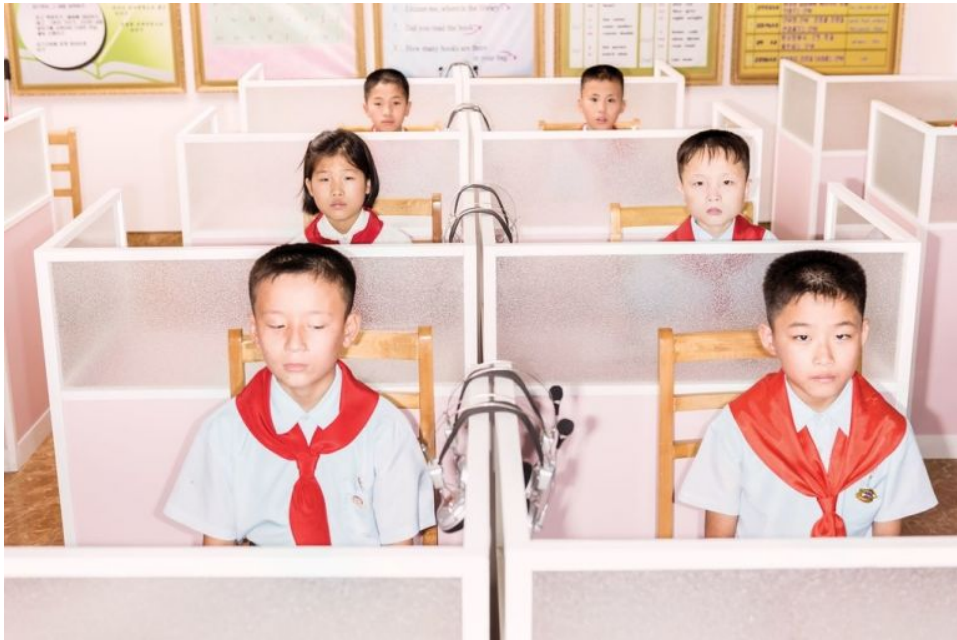
Students at the Pyongyang Orphans' Secondary School, which is housed in a new brick-and-steel complex. In a class of ten- and eleven-year-olds, one boy asked, “Why is America trying to provoke a war with us?” North Korea, 2017.

The weak enforcement of sanctions, and continued demand from China and Russia, has allowed North Korea’s economy to grow with surprising speed in recent years. According to South Korea’s central bank, North Korea’s G.D.P. grew an estimated 3.9 per cent in 2016, the fastest pace since 1999. (South Korea’s, by comparison, grew 2.8 per cent.)