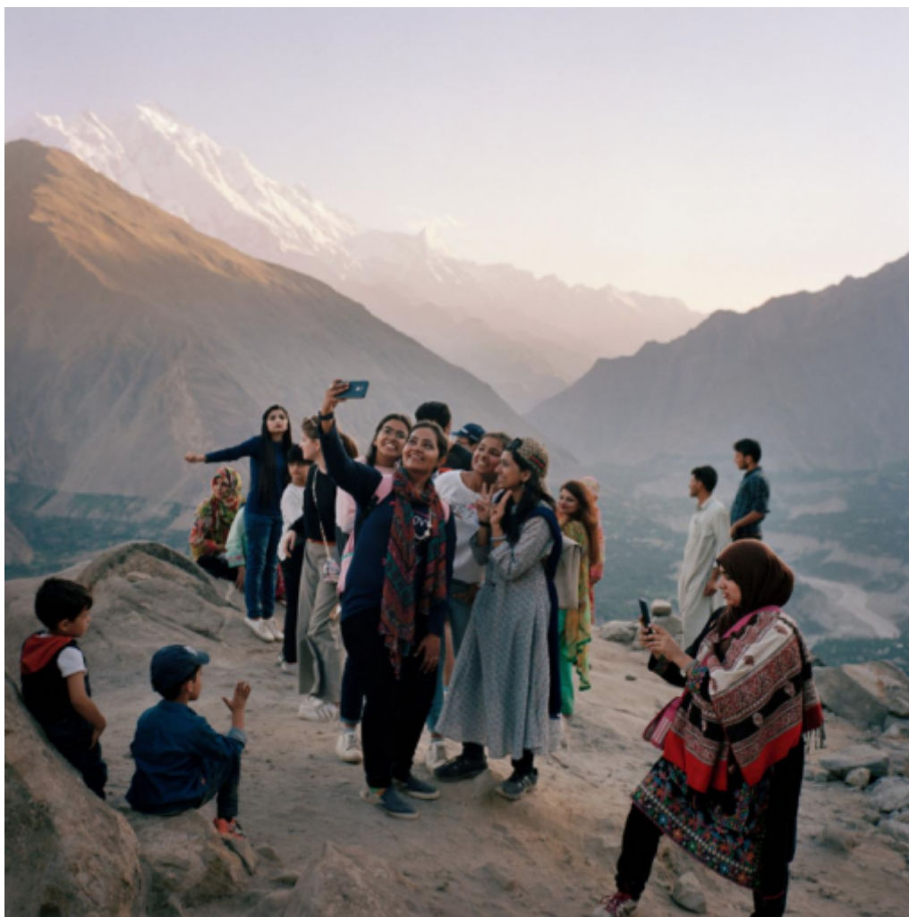
Tourists from Karachi pose for a selfie overlooking the Karakoram mountain range in the Hunza valley. The group of young women came to "escape city life," they said. Pakistan, 2019.

memoirs-of-trailblazing-activists/) in the streets of Lahore. The date became known as a “black day for women’s rights,” Naz says, and was later declared Pakistan’s National Women’s Day.