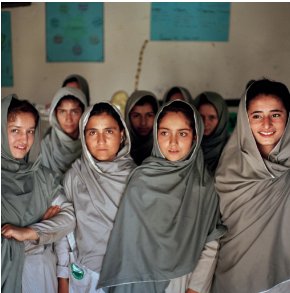
Both Sunni and Shia students study at a girls’ school in Minawar, a village near Gilgit in the province of Gilgit-Baltistan. Pakistan, 2019.