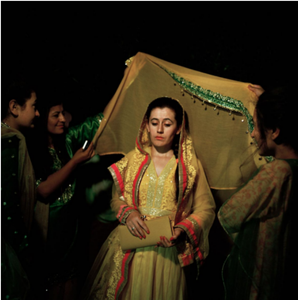
An Ismaili bride participates in one of many marriage rituals in the Hunza valley. This bride is marrying for love rather than by family arrangement. Pakistan, 2019.