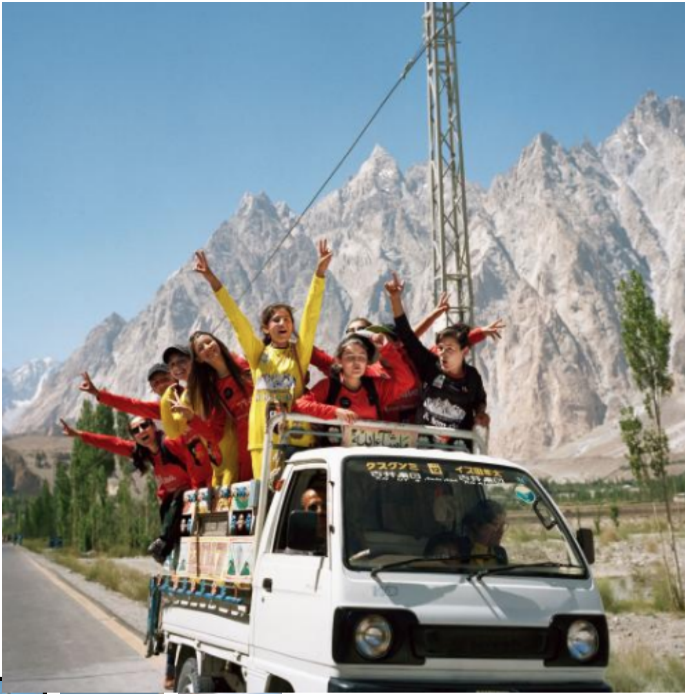
Teenage girls from Gulmit load up in a van after an all-female soccer tournament meant to promote gender equality in the Hunza valley of northern Pakistan. Pakistan, 2019.

The remote tribal area that borders Afghanistan, formally called the Federally Administered Tribal Areas (FATA) ( http://fata.gov.pk/ ) of northwestern Pakistan, has traditionally been least tolerant of women in public spaces, some women activists say. Yet registration in 2018 increased by 66 percent ( https://tribune.com.pk/story/1769046/1-women-minorities-represented-polls-eu-observers-report-says/ ) from 2013. This rise in women's votes is a victory for women like Khaliq, who are fighting for women's inclusion and equality in Pakistan, especially among marginalized communities in rural and tribal areas.