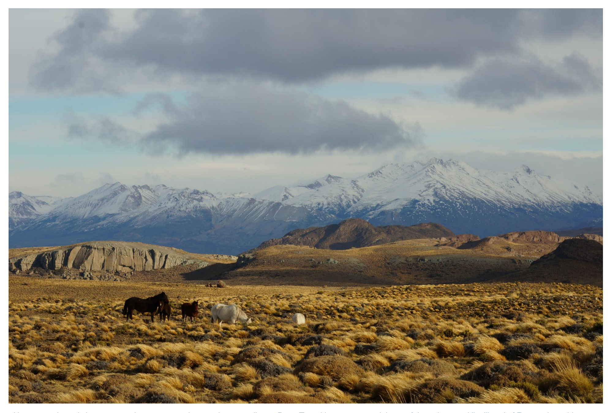
Horses, cattle and sheep—un-welcome, non-native species according to Doug Tompkins—are a crucial part of the culture and livelihood of Patagonia residents. Patagonia, 2014. See reporting here