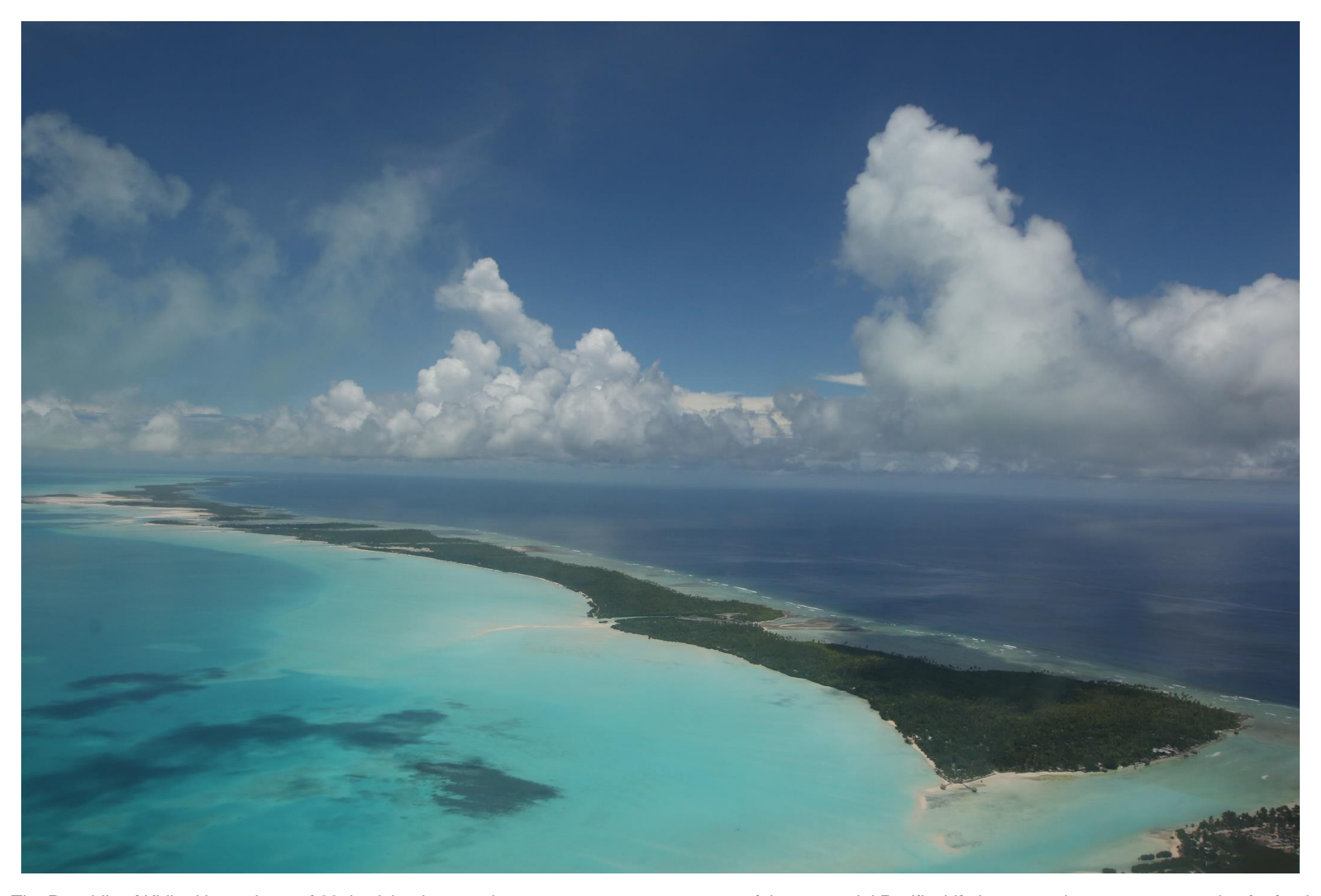
The Republic of Kiribati is made up of 33 tiny islands spread across an enormous expanse of the equatorial Pacific. Life has never been easy scrounging for food and water on narrow ribbons of land that rise, on average, little more than six feet above the sea. It's going to be more difficult, if sea levels rise three feet or more this century, as scientists predict. Kiribati, 2014. See reporting here