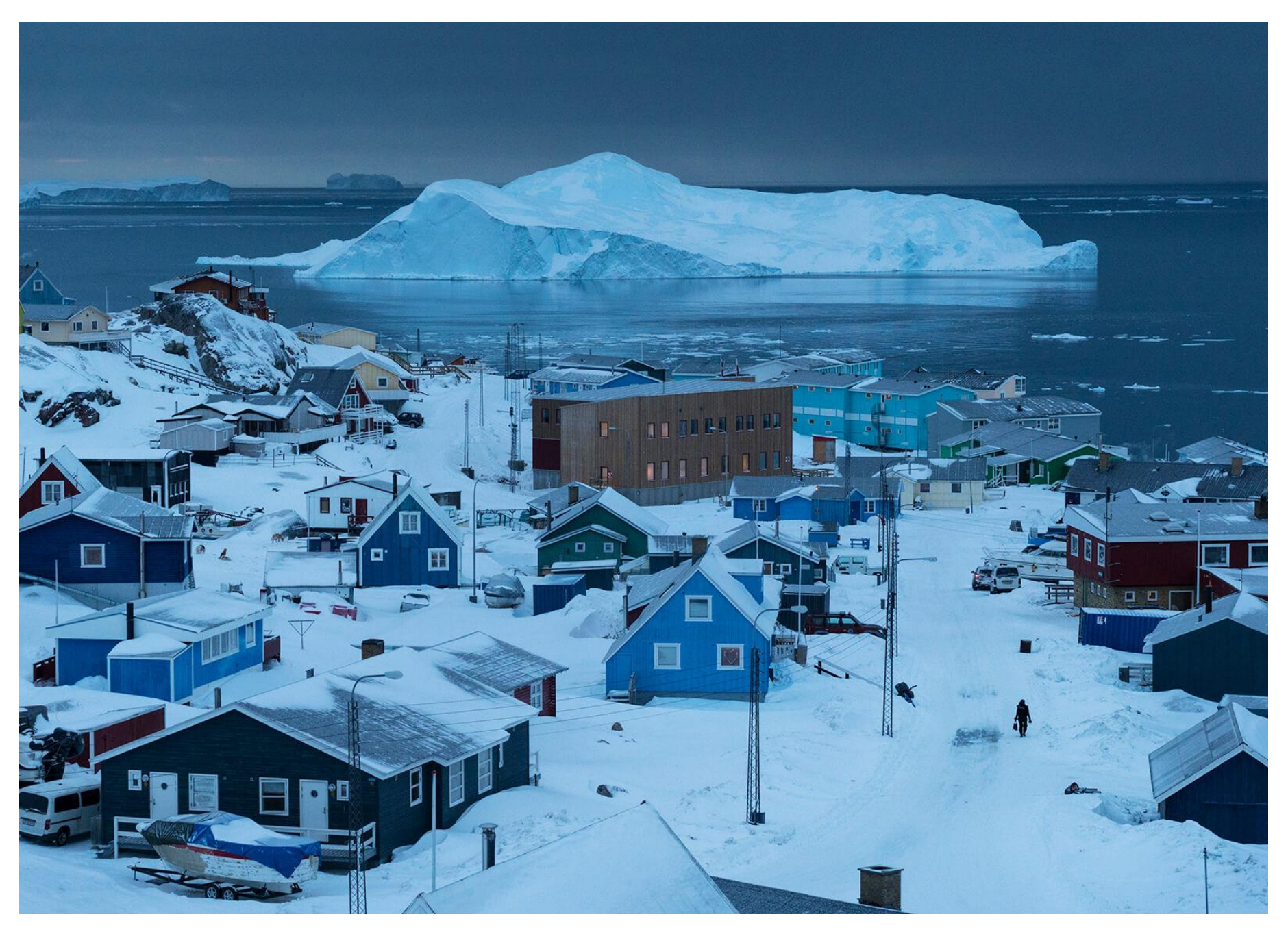
The town of Ilulissat, Greenland's third largest, with a population of 4,400. Greenland, 2018. See reporting here