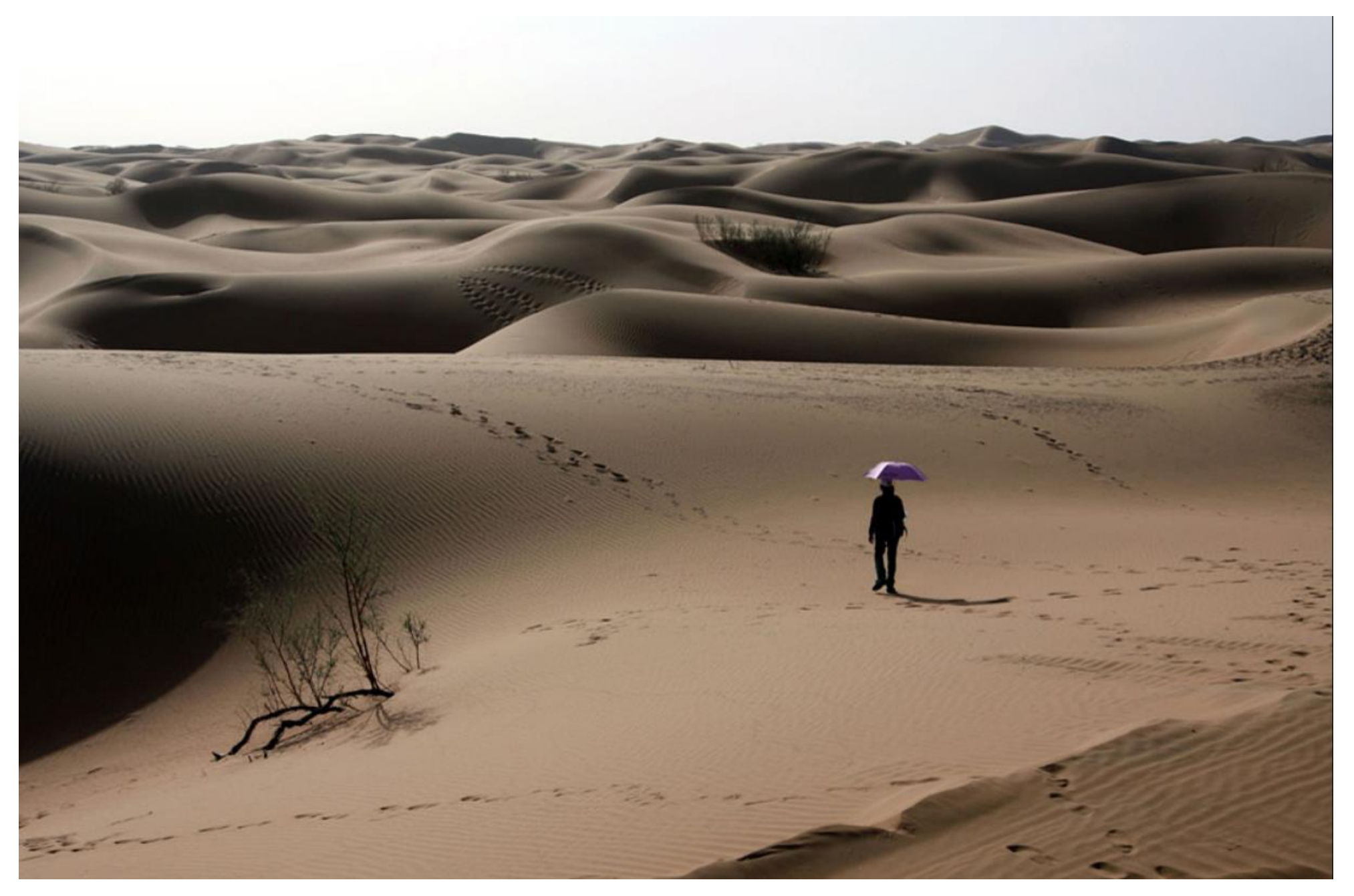
A tourist at the Shapotou desert resort in the Ningxia region. China, 2009. See reporting here