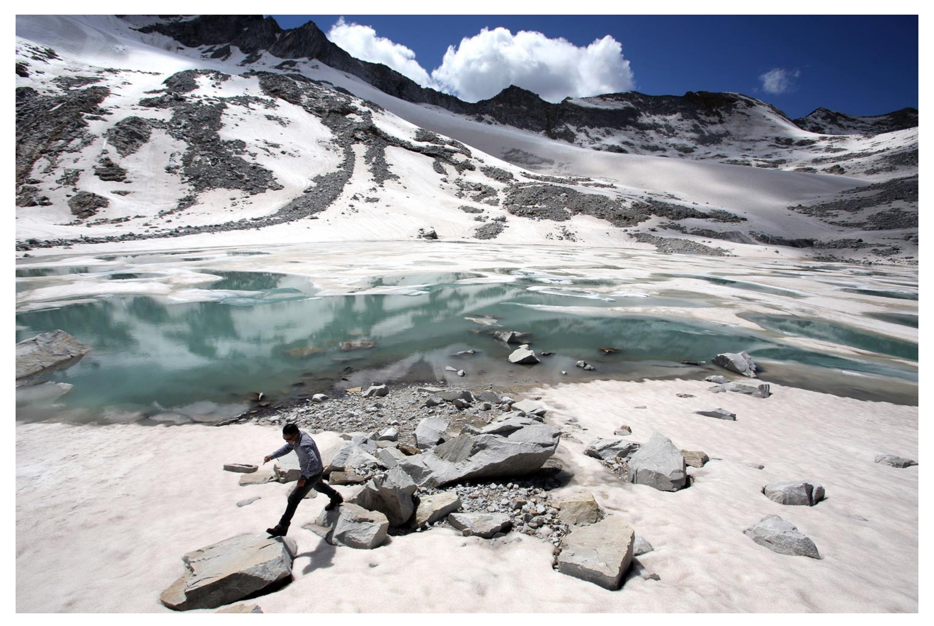
British photographer Sean Gallagher spent the past seven years casting the spotlight on China's environmental crises. Here, a man walks over rocks near to a glacial lake that has formed at the base of the Dagu Glacier on the southeast edge of the Tibetan Plateau. The glacier has been reducing in size in recent years, as a resulting of rising temperatures in the region. China, 2012. See reporting here