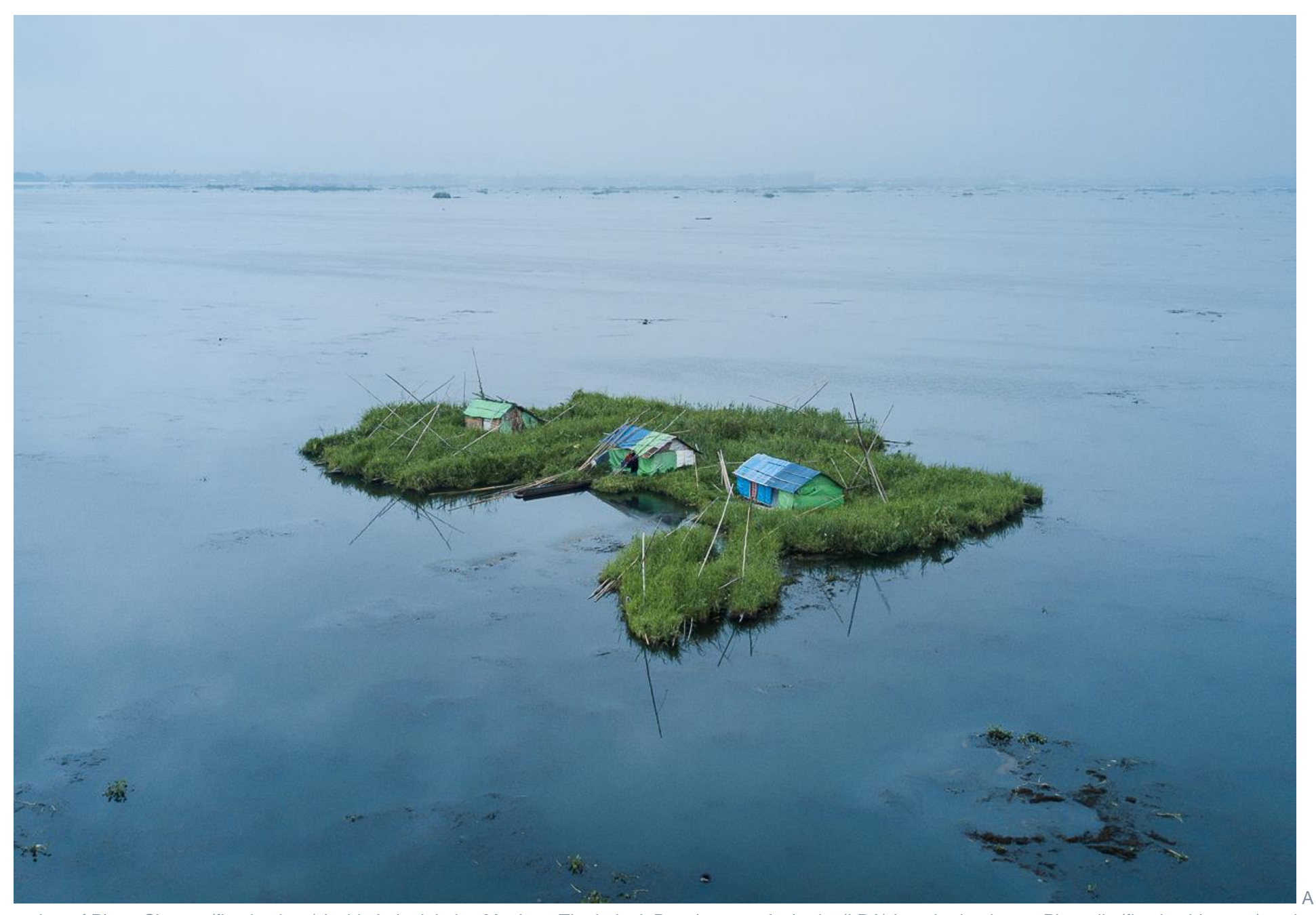
view of Phum Shangs (floating huts) inside Loktak Lake, Manipur. The Loktak Development Authority (LDA) has dredged most Phumdis (floating biomass) and Phum Shangs in the name of lake cleanup. India, 2017. See reporting here