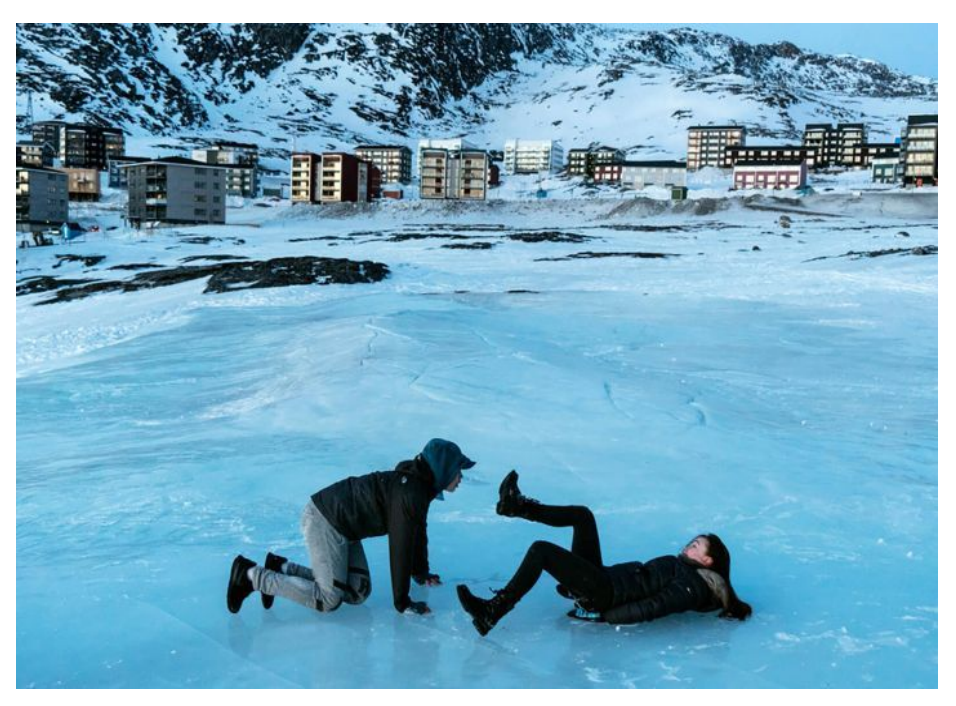
Young people play on an icy hillside in front of a neighborhood in Nuuk. Greenland, 2018.