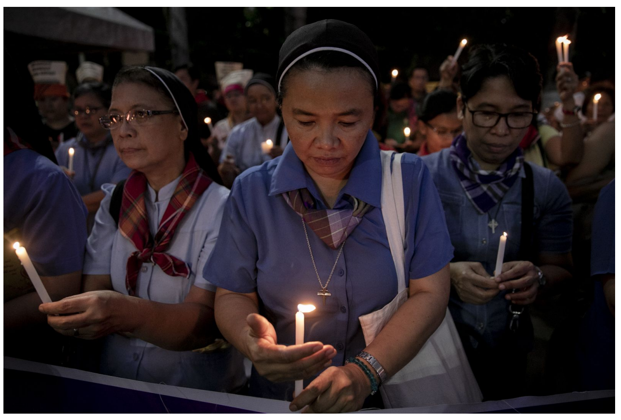
Nuns light their candles during a demonstration calling for "truth, justice, and peace" across Malate Church in Manila. Philippines, 2019.