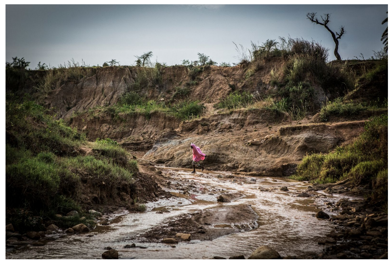
A stream near Nghar Village in Nigeria's Gashish District, where more than 200 people were killed in June by men thought to be cattle herders. Those killed were part of the farming community, which uses land the herders covet. Nigeria, 2018.