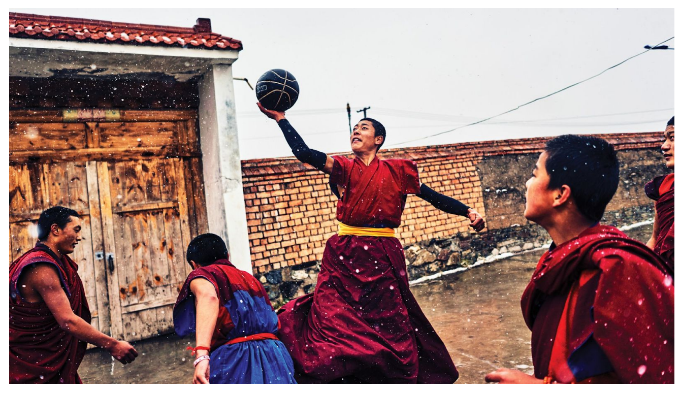
Monks, nomads, and a sport's unlikely ascent in a remote corner of the globe. Tibet, 2018.