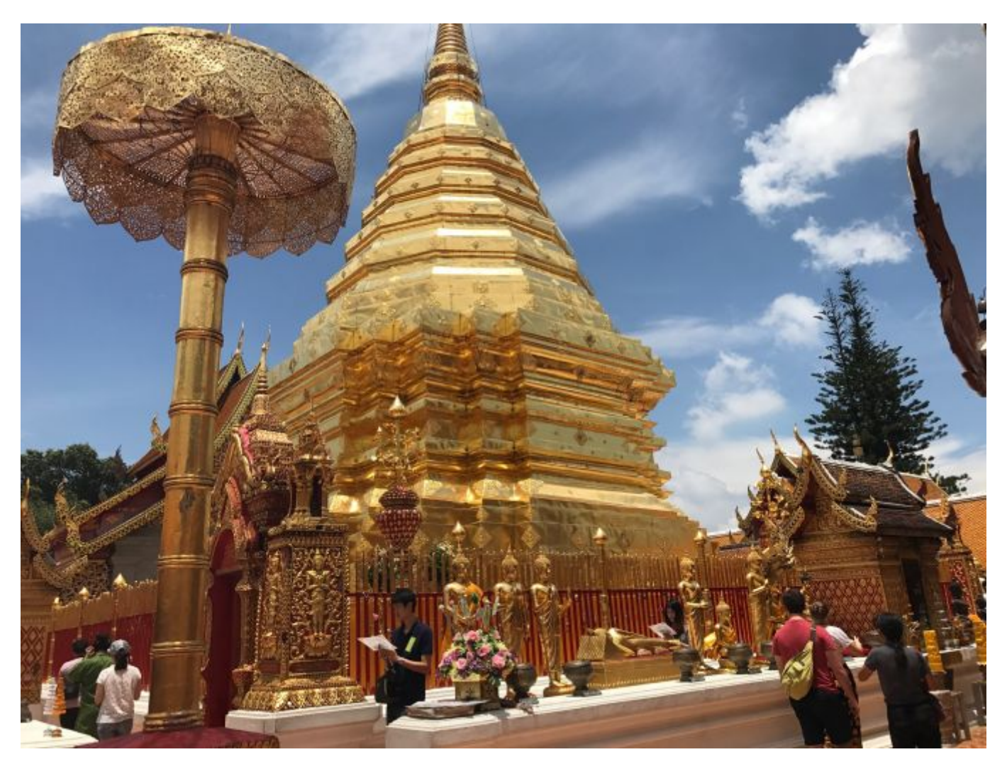
Wat Phra That Doi Suthep, a Buddhist temple found at the top of the Doi Suthep Mountain in Chiang Mai. Thailand, 2018.

Ecology monks like Phra Sangkom have been marked as leading environmental advocates in Thailand, but some have also been marked with a target on their back.