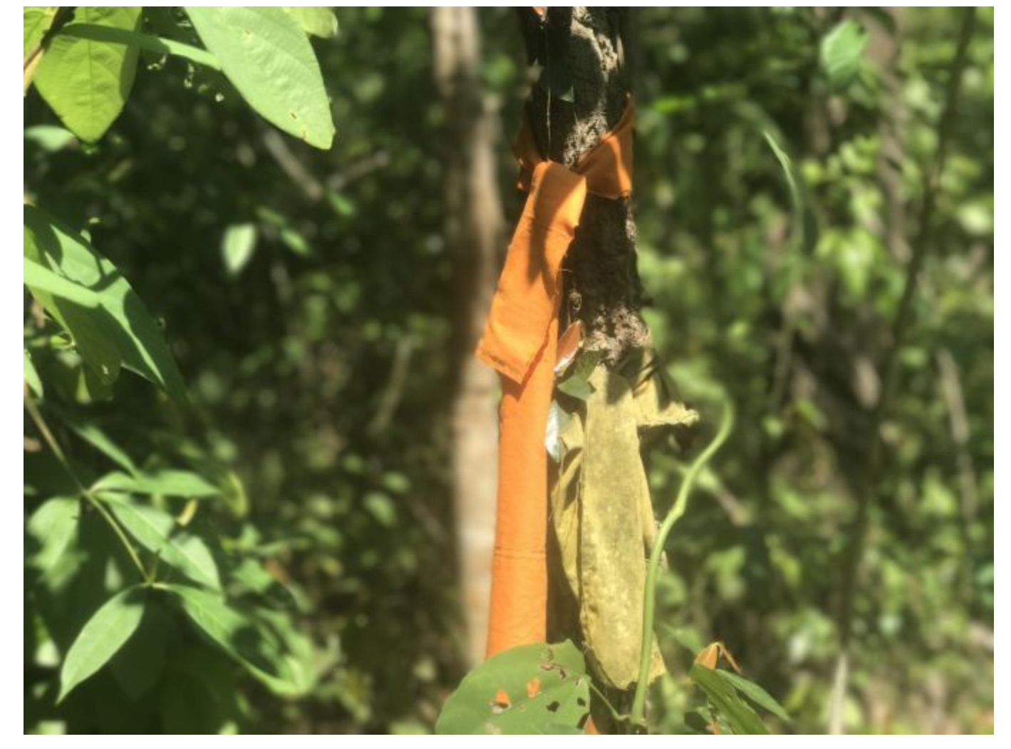
An ordained tree wrapped in the orange robes of a Buddhist monk found in a forest of Chiang Mai. Thailand, 2018.