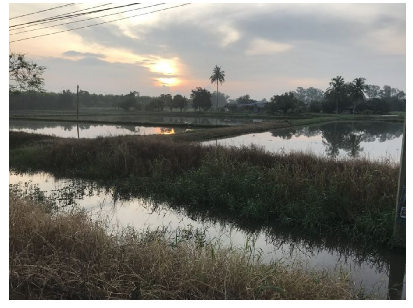
A farm in Surin, Thailand, that only grows rice in its many fields. Thailand, 2018.

"They plant corn, they harvest it, they sell it to the big company and earn just about enough to pay off their debt," said Congdon. "It creates this vicious cycle of dependency on the large companies and the farmers never get ahead, which leads to more and more deforestation."