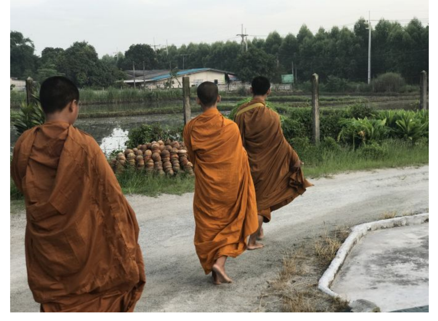
Three monks. Thailand, 2018.

This story was also published in The Forum of Religion and Ecology at Yale (http://fore.yale.edu/news/item/ecology-monks-in-thailand-seek-to-end-environmental-suffering/) on August 13, 2018.