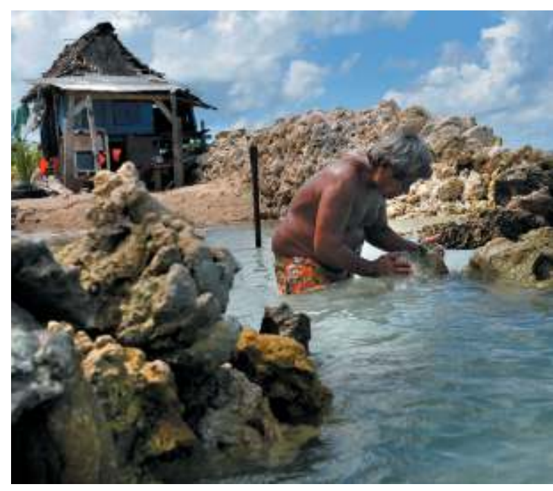
A man rebuilds the sea wall that protects his home on South Tarawa.

He also believes that most scientists make a mistake by tethering the fate of atoll islands to the health of surrounding coral reefs. Even if reefs