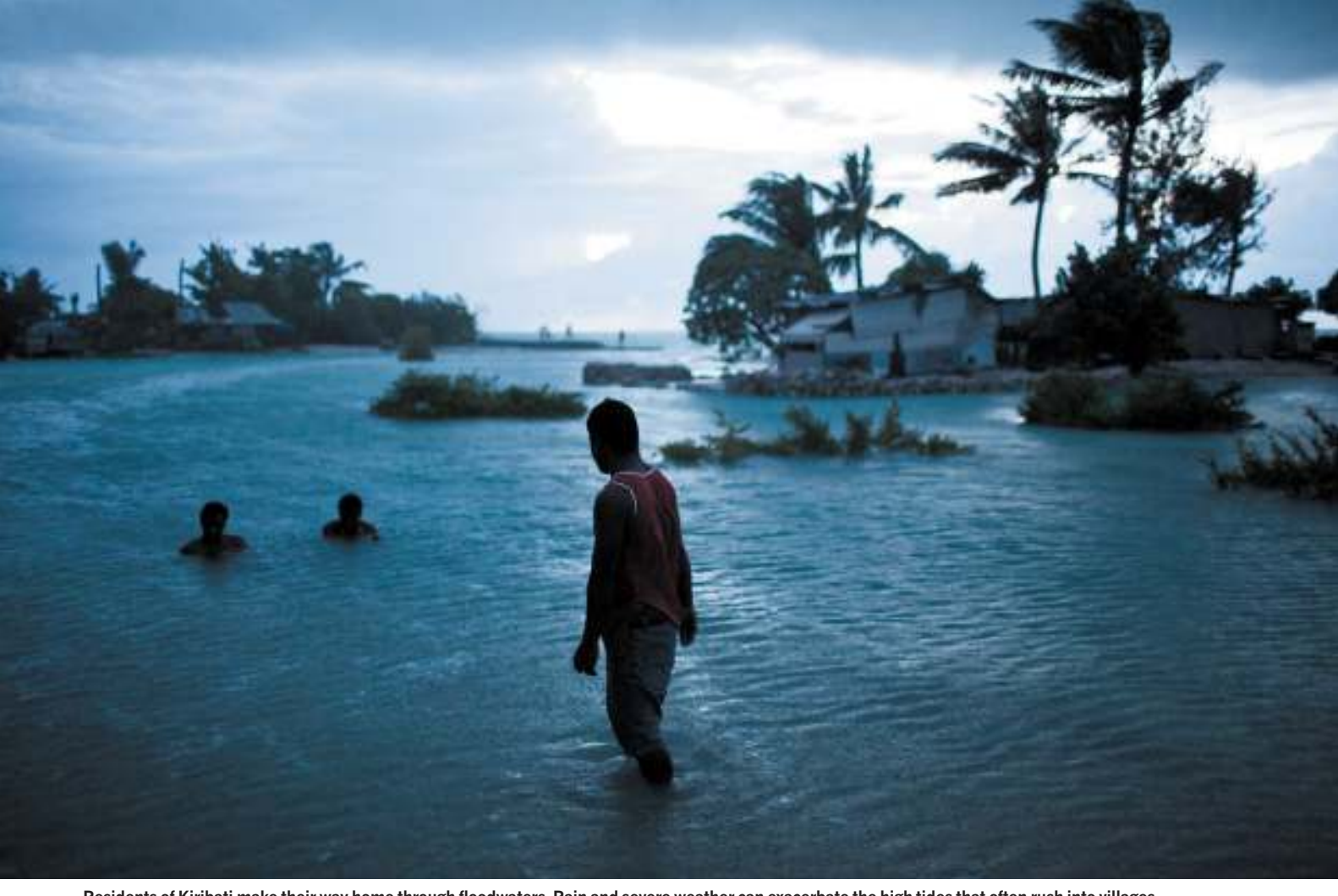
Residents of Kiribati make their way home through floodwaters. Rain and severe weather can exacerbate the high tides that often rush into villages.